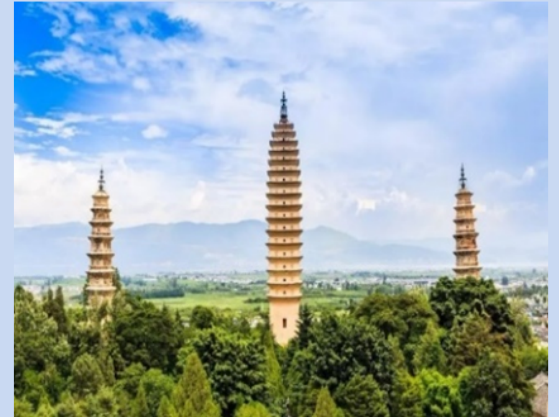
Dali ancient town