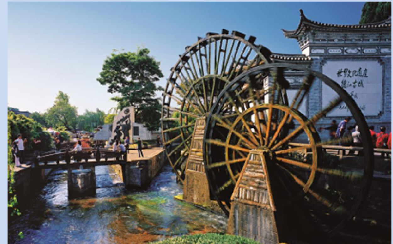
Lijiang old town